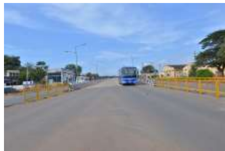
View of Navanagar Grade Separator Hubli end