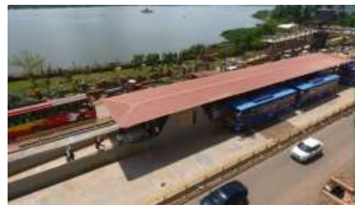
Median Bus Stand