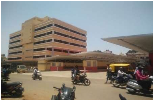
City Bus Terminal at Hubballi