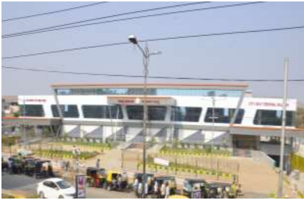
City Bus Terminal Ballari