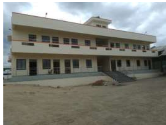
Bus Depot at Sindhanoor