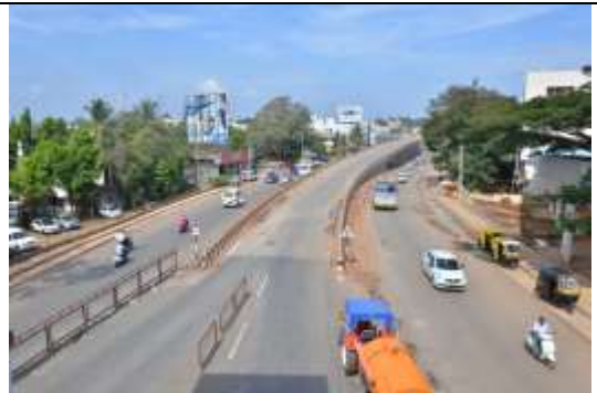
Combined View of MTL and BRT Lane at Uncal

The estimated total project cost is revised to 970.87 Crores of which assistance from World Bank is 344.00 Crores. Up-till now an amount of Rs. 929.00 Crores has been utilized. Additional fund requirement Rs. 41.87 crores based on revised project cost has been requested from State Government.