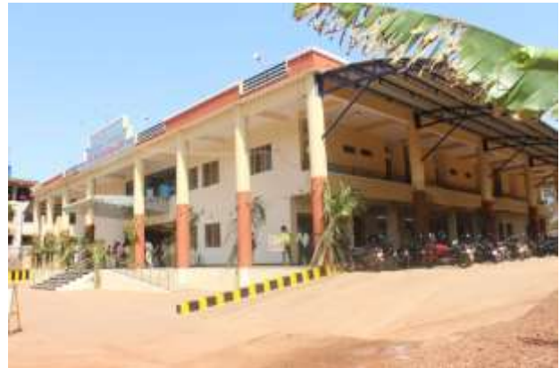
City Bus Terminal at Bidar